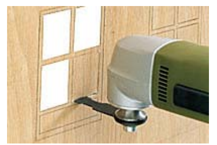
For precision square excavations, HSS immersion saw blades are available with an 8 and 14mm width of cut.